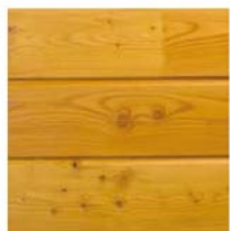
UV PROTECTION + WOODCARE